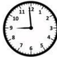
One to nine