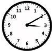
Ten past three

Read each clock and write the time in words.