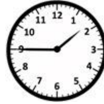
Quarter to two