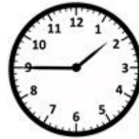
Quarter to two